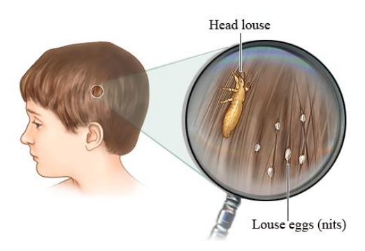
WebMD Medical Reference from Healthwise