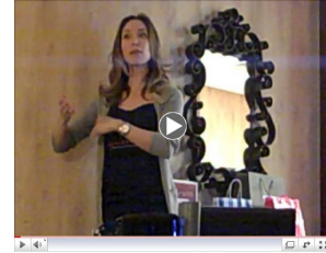
Lunch and Learn Seminar: Voluma XC, Growth Factors

For those of you who could not attend, our Lunch and Learn has been posted to our clinic's YouTube channel. Click the link below to watch it in it's entirety.