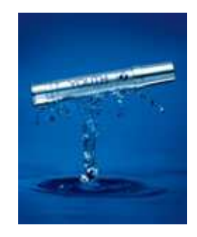
iS Clinical Youth Complex SALE PRICE: $125.80+tax (you save $22.20) This moisturizer is great for all skin types. It contains hyaluronic acid that immediately plumps the skin, fruit extracts that improve texture, as well as plant based ingredients that firm and tighten the skin. Perfect

It is very important to give your skin the hydration it needs; without moisture, our skin appears older and fine lines and wrinkles are more apparent. A good moisturizer will help reduce lines, allow your skin to function at a higher level and protect you from the wind and cold. Whether you are oily or dry, there is a moisturizer for you that will help you fulfill your skin care needs.