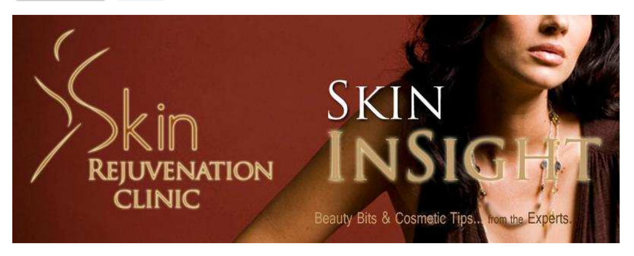
E-Newsletter of Skin Rejuvenation Clinic | Edina, MN November 2013 edition

Check out our November specials just below this month's feature article!