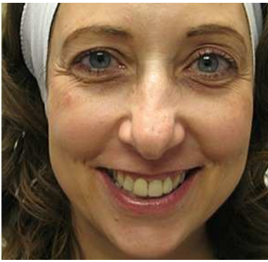
After 2 Forever Young BBL Treatments