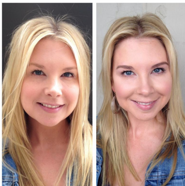
Before & After One of Our Bright Eyes Treatments