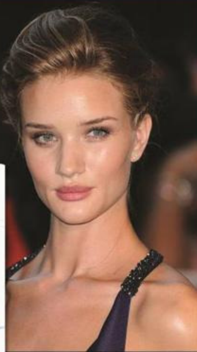
Rosie's Beauty Essentials